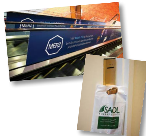
EXHIBIT & SPONSORSHIP OPPORTUNITIES

Exhibit - Securing exhibit booth space at the AAP Annual Meeting will put you in front of 1,800+ of today's and tomorrow's leading physiatrists. Exhibit space offered includes 10'x10' booths, 10'x20' booths, and 20'x20' islands.